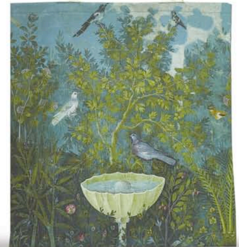
Fresco Garden Bag Anemone Tea Towel Oxford Skyline Cushion London, London Cushion Designed by Alice Palace for the Museum of London