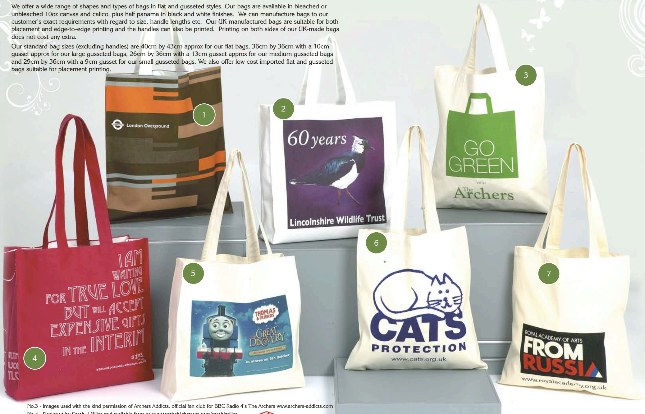
No.3 - Images used with the kind permission of Archers Addicts, official fan club for BBC Radio 4's The Archers www.archers-addicts.com

Our standard bag sizes (excluding handles) are 40cm by 43cm approx for our flat bags, 36cm by 36cm with a 10cm gusset approx for our large gusseted bags, 26cm by 36cm with a 13cm gusset approx for our medium gusseted bags and 29cm by 36cm with a 9cm gusset for our small gusseted bags. We also offer low cost imported flat and gusseted bags suitable for placement printing.