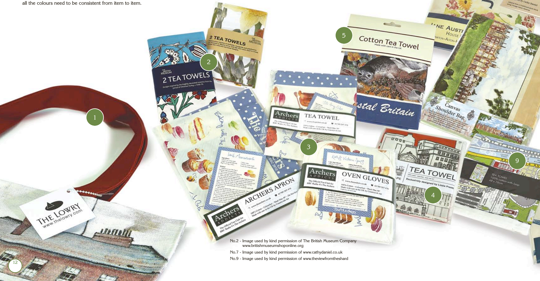
No.2 - Image used by kind permission of The British Museum Company www.britishmuseumshoponline.org